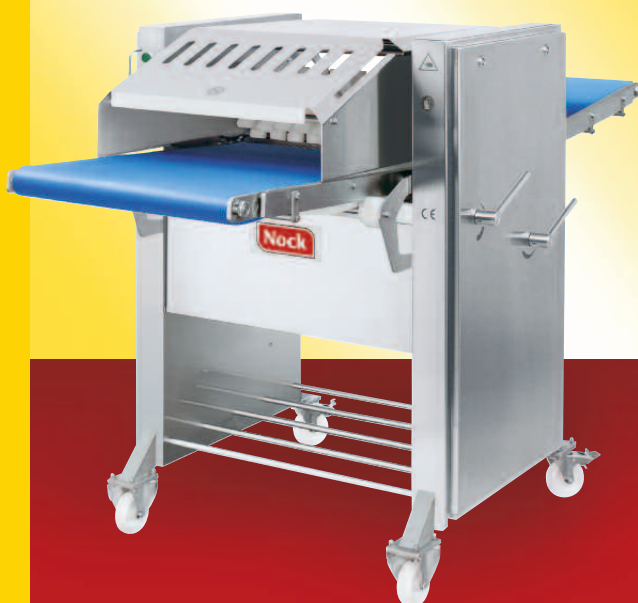
Photo: NOCK Cortex CBP 695 POULTRY with plastic modular belts (option)