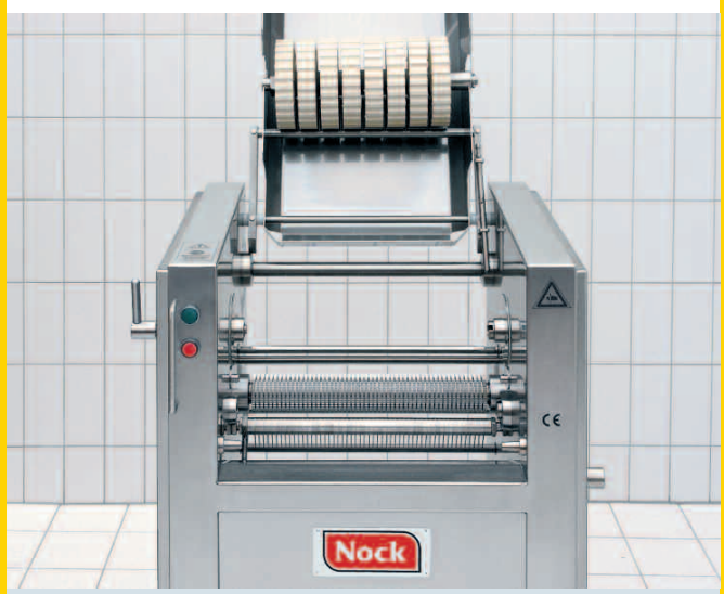
Quick and easy to clean:

NOCK derinder after removing conveyor, pressure roller and blade holder. Scraper comb tilted back.