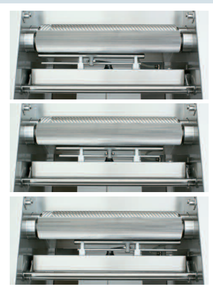
NOCK Air Jet compressed air cleaning system: Jet bar moved by an enclosed pneumatic cylinder

Tip: Membrane skinning machines are not suitable to remove the fat from products, as fat does not have a firm structure. To speed up the membraning process it is recommendable to remove the fat when cutting the meat.