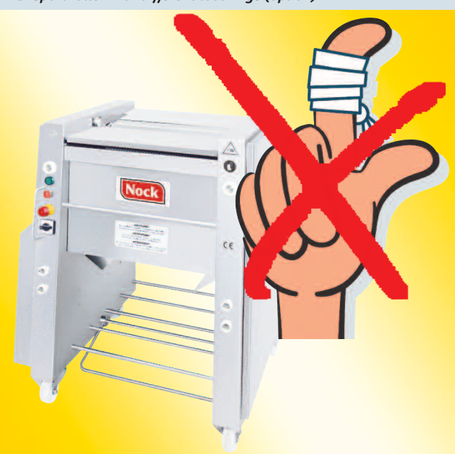
Simply safe: The new NOCK IMMEDIATE CUT-OUT® (ICO) safety system (option)