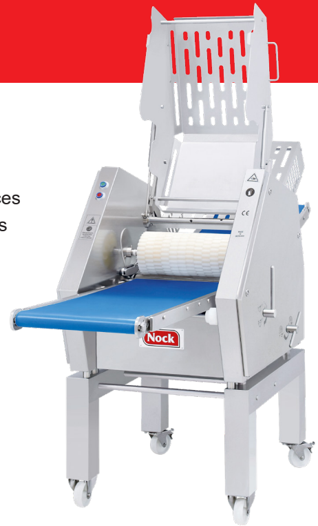
front view cover open