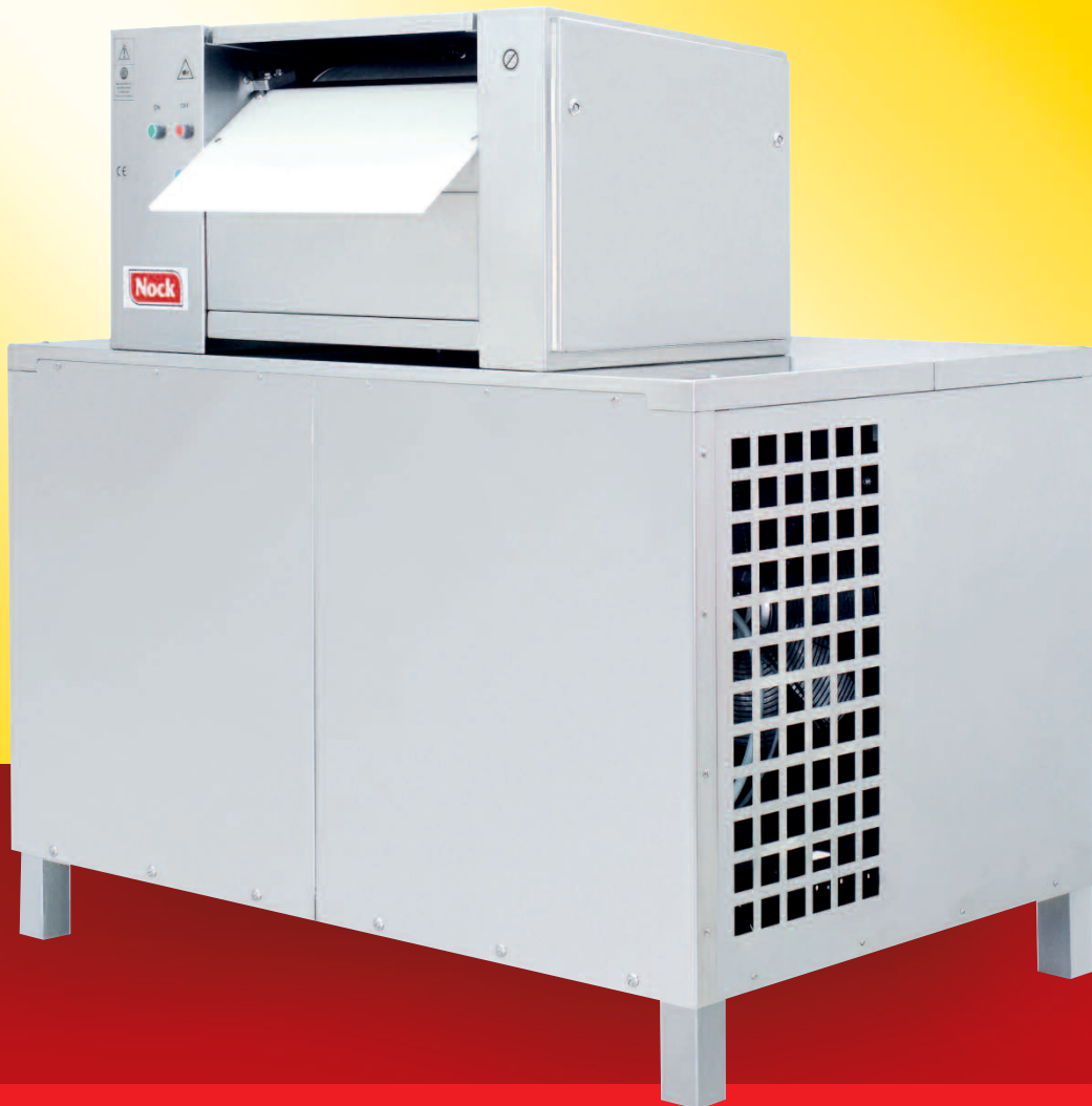
NOCK NRE 2500